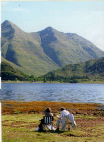
Loch Duich, near Dornie