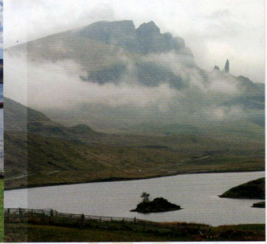
Old Man of Storr and Trotternish Ridge

trips, a railway station, shops and even palm trees to confirm the prevailing mildness. Nearby are lots of points of interest, including Lochalsh Woodland Garden and the much photographed Eilean Donan Castle. The famous landmark peaks of the Five Sisters of Kintail are part of the Kintail estate in the care of the National Trust for Scotland.